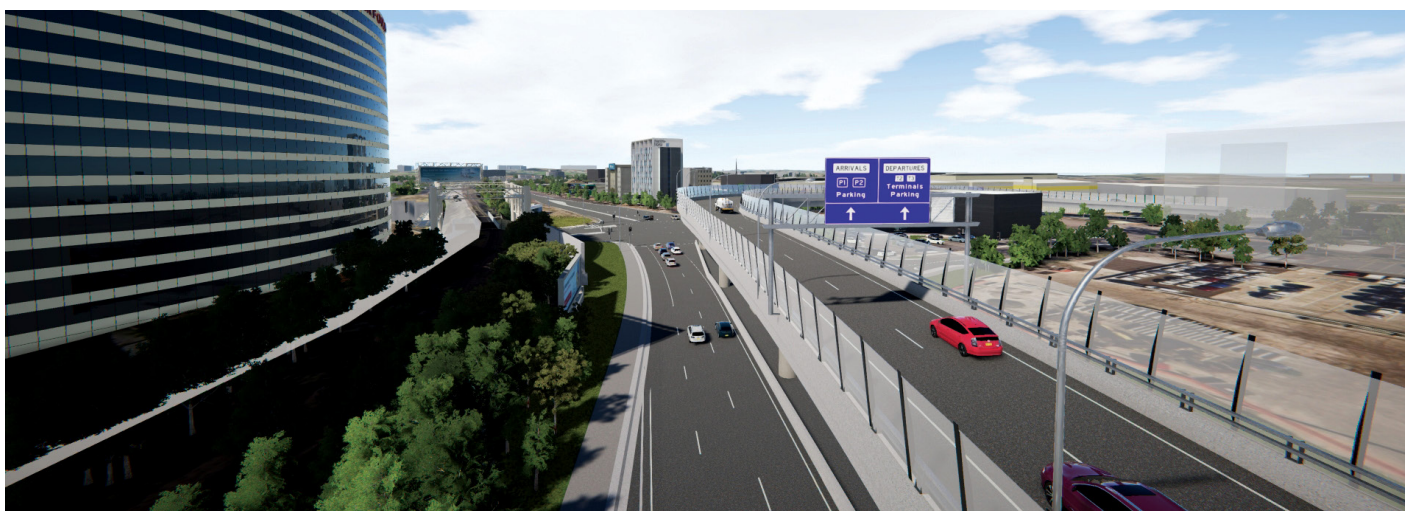
Sydney Gateway Project: Proposed routes shown, subject to change based on detailed design

This document contains important information about road projects in your area. If you require the services of an interpreter, please contact the Translating and Interpreting Service on 131 450 and ask them to call the project team on 1300 862 844. The interpreter will then assist you with translation.