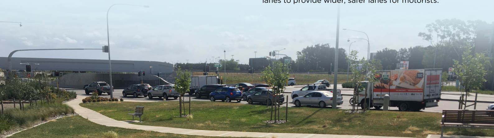
New park corner of Botany Road and West Avenue, Airport East