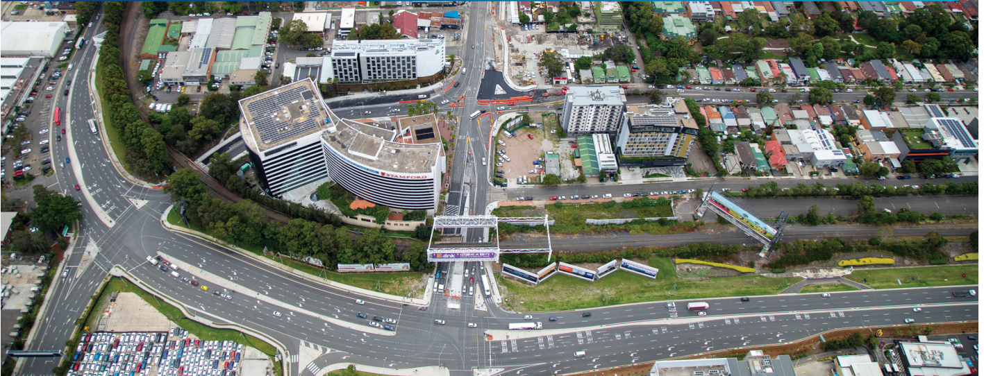
Airport North: project view from Sydney Airport

Sydney Airport and Port Botany are two important international gateways used for the movement of millions of people and goods around the country each year.