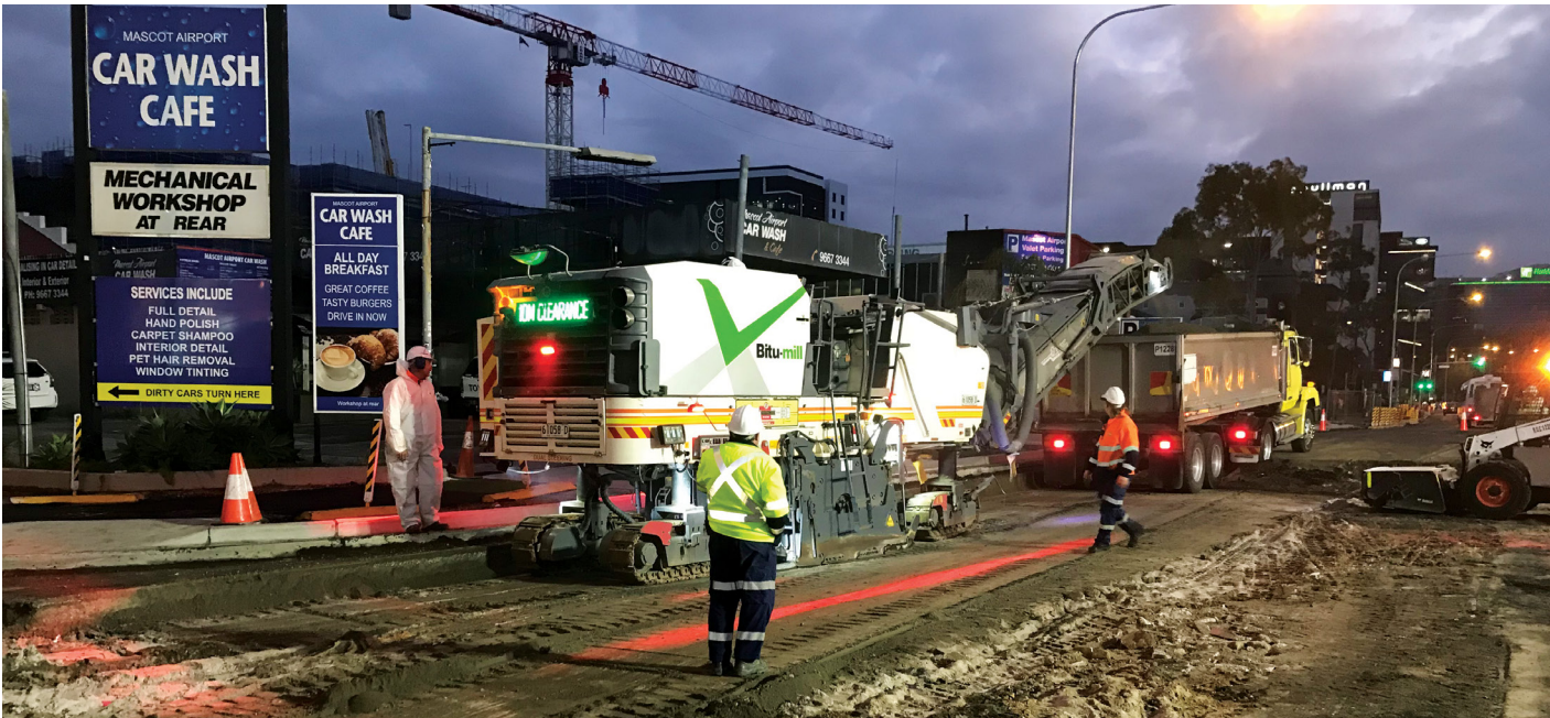
Airport North: milling road surface at O'Riordan Street