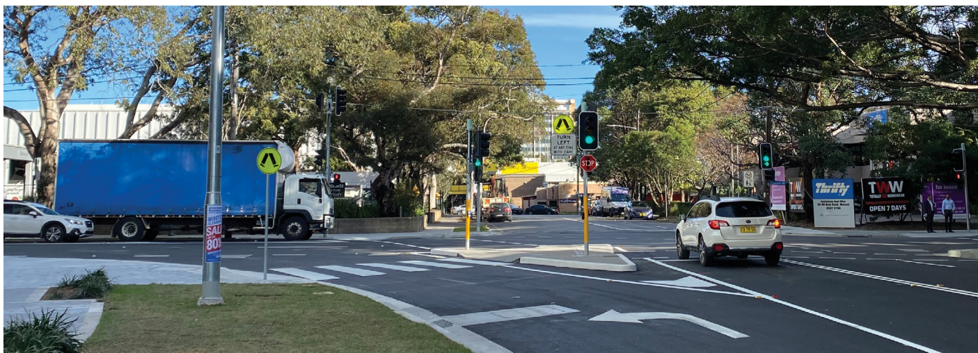
The newly constructed slip lane from Kent Road into Coward Street opened on 5 August 2020