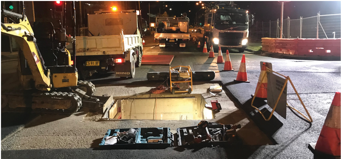
Airport North: utility work at the intersection of O'Riordan and King Street