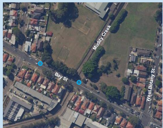
● Location of work