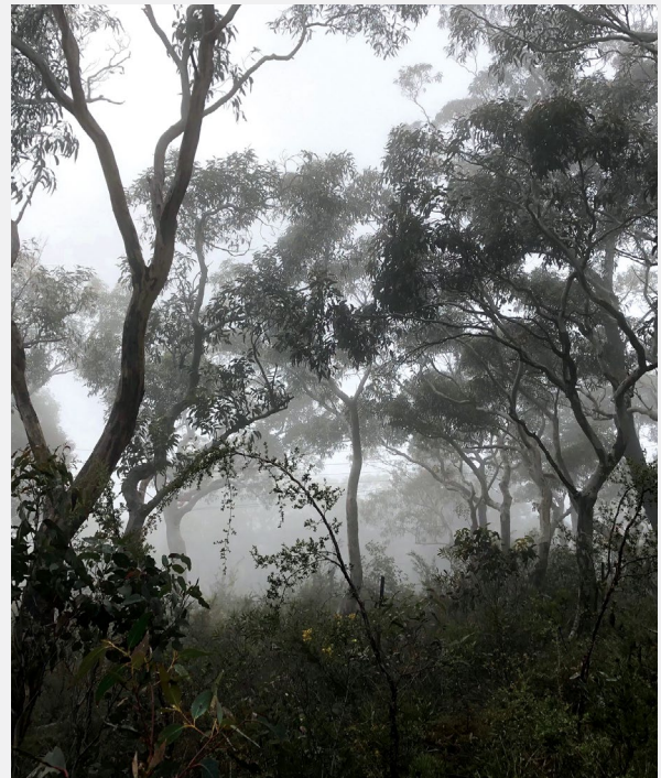
Environmental, economic and social impacts are assessed by the EIS