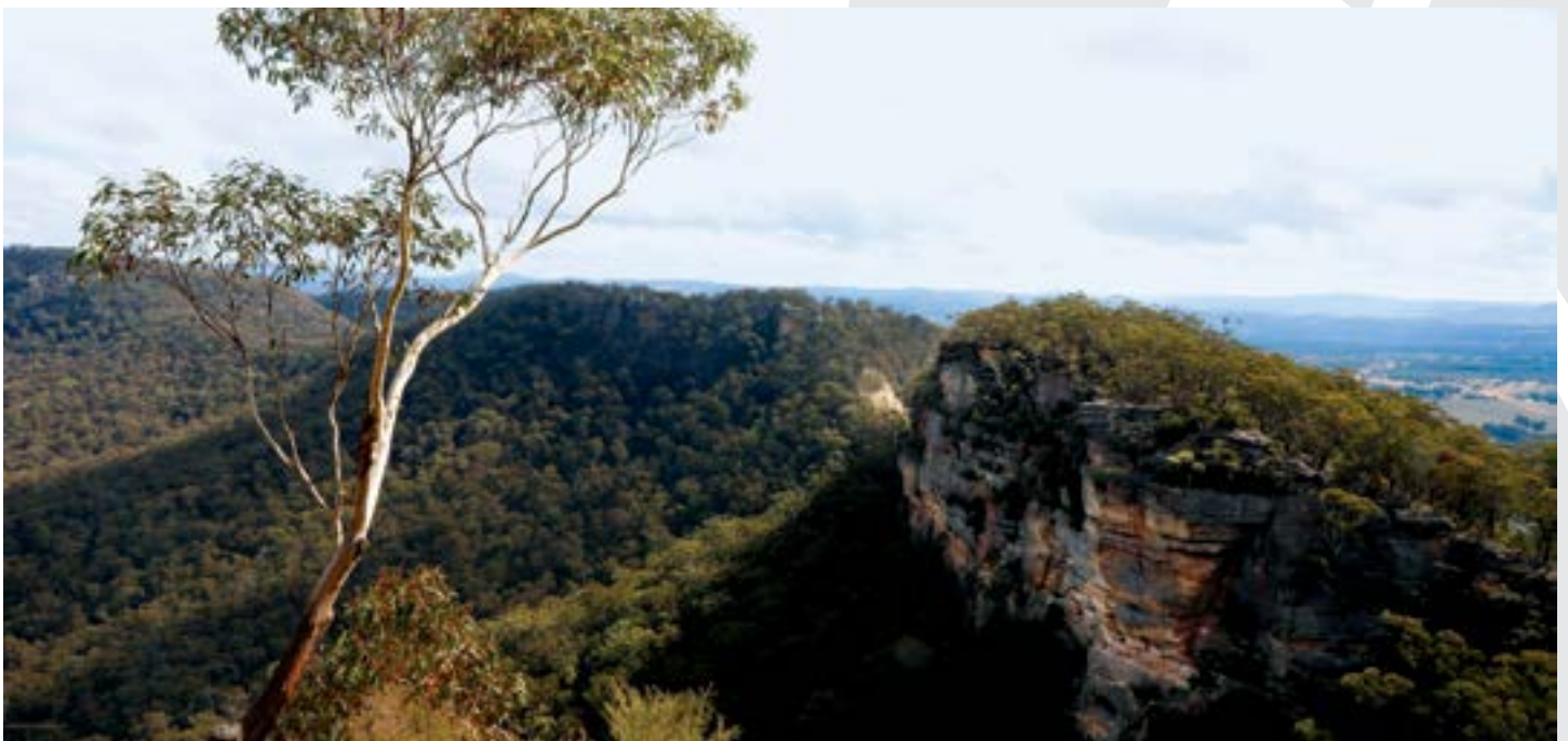
From Mitchell Ridge looking at Victoria Pass

An urban design strategy will form part of the environmental assessment. It is still too early to detail precisely what this would look like, including if features like noise walls would be required. This will be an important part of future public consultation and stakeholder engagement.