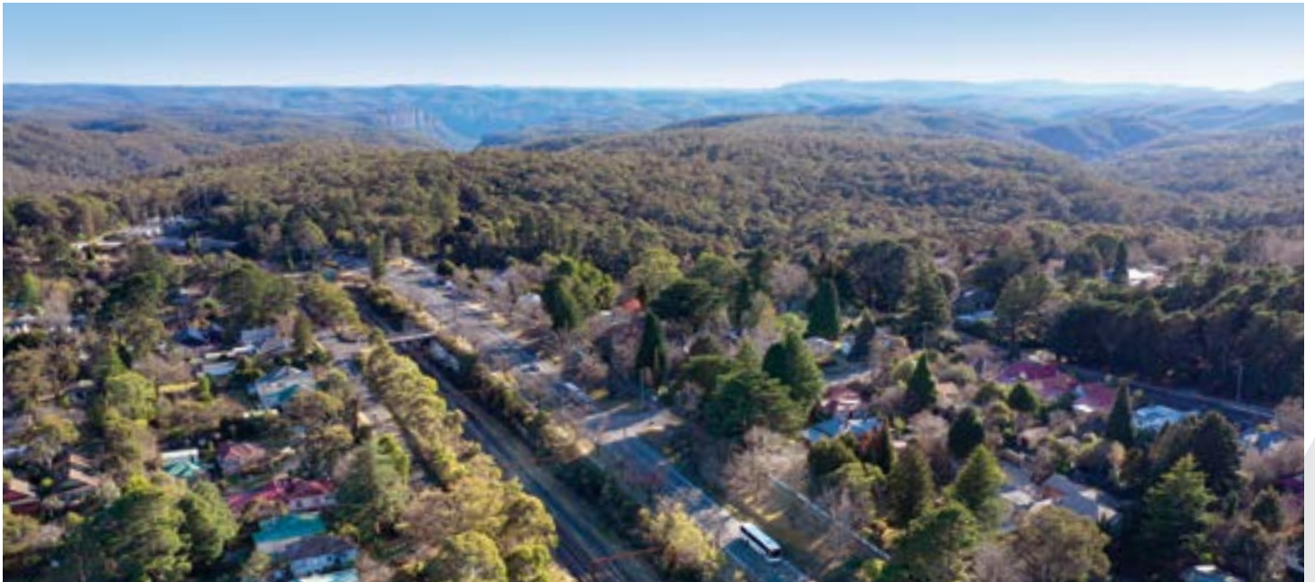
Blackheath over the train station looking north