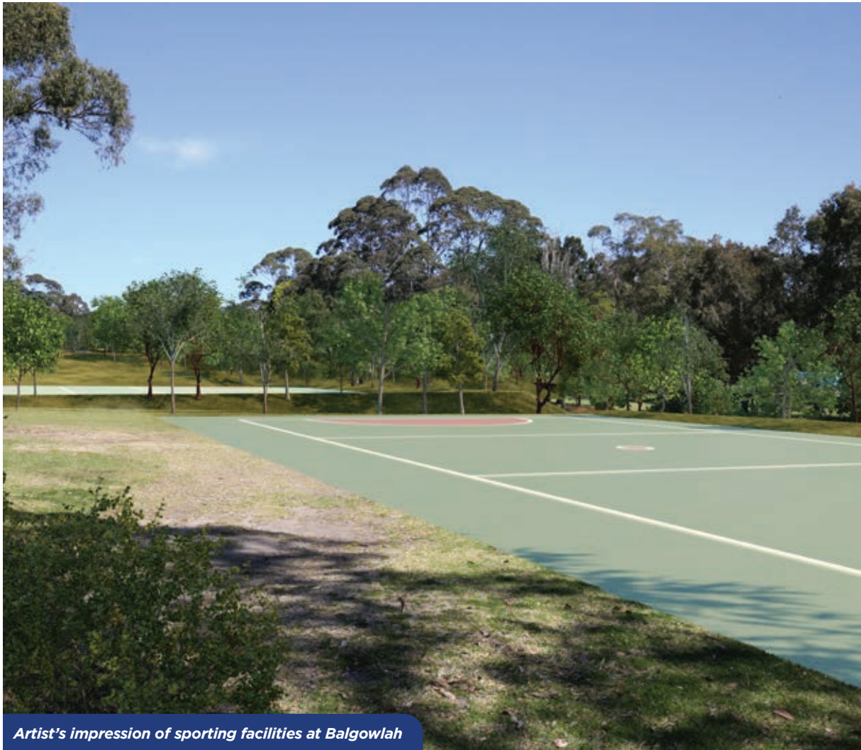
Artist's impression of sporting facilities at Balgowlah