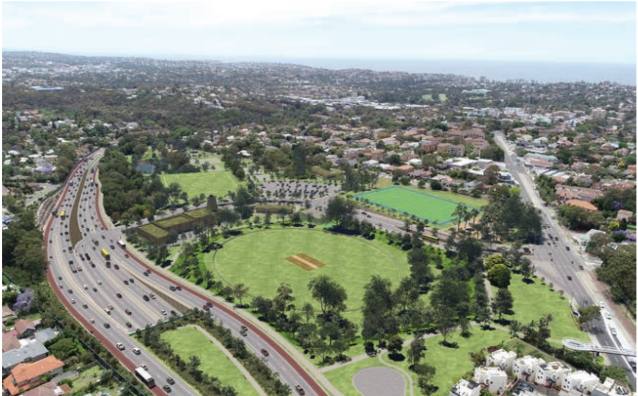
Artist's impression of new and improved open space and recreation facilities at Balgowlah. Indicative only.